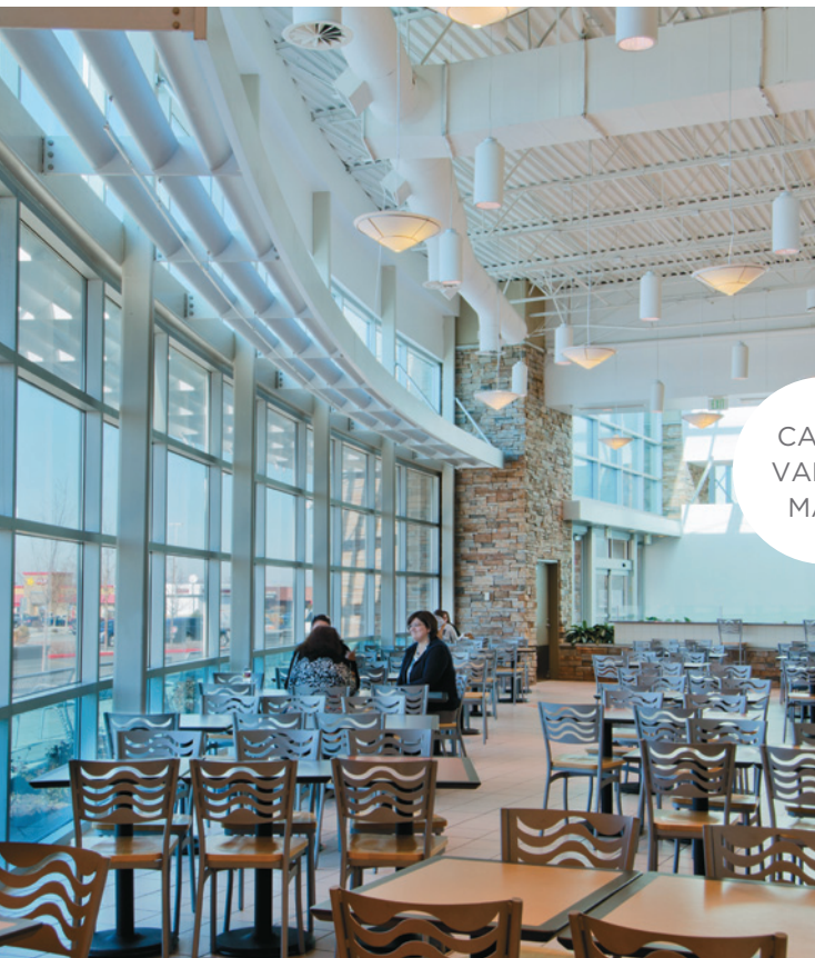
CACHE VALLEY MALL